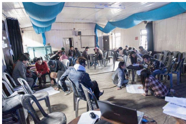
Photo (right): A typical activity where individual groups brainstormed answers to a range of situations and then presented them to the class.